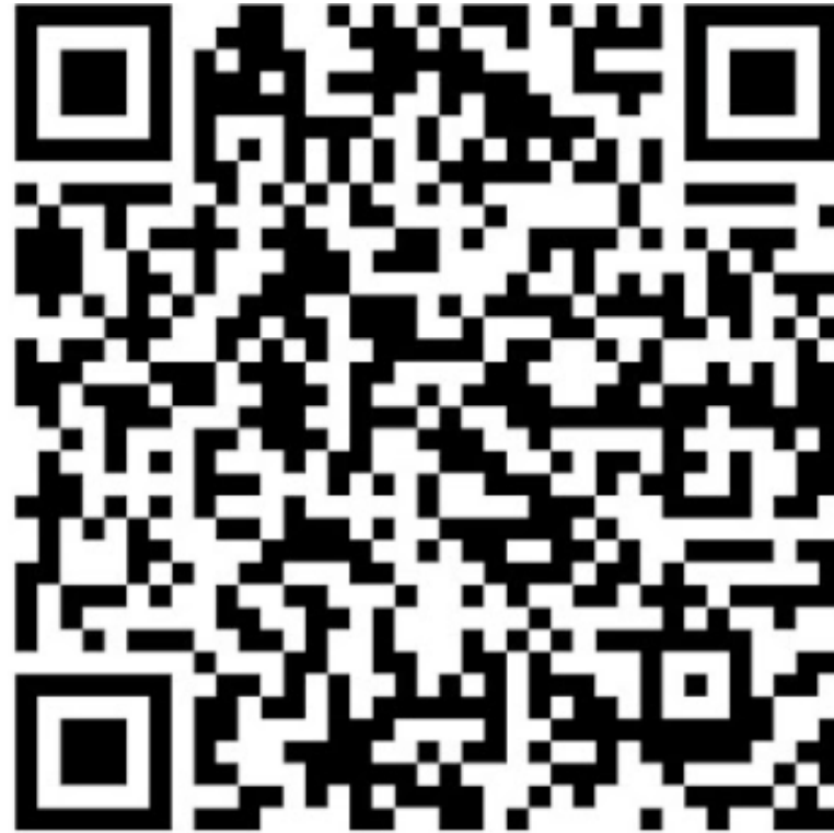
LinkedIn profile URL